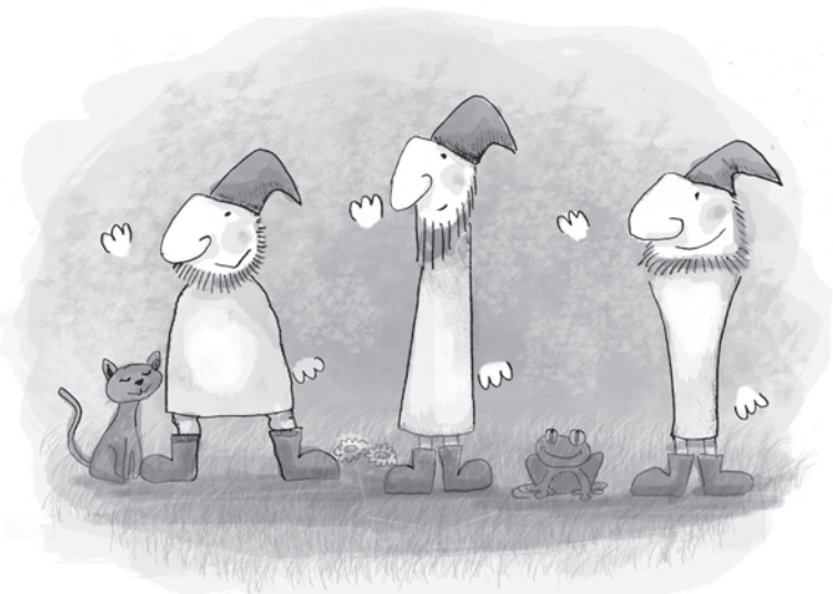
Sir Oldguard Sir Phobos Sir OutPut